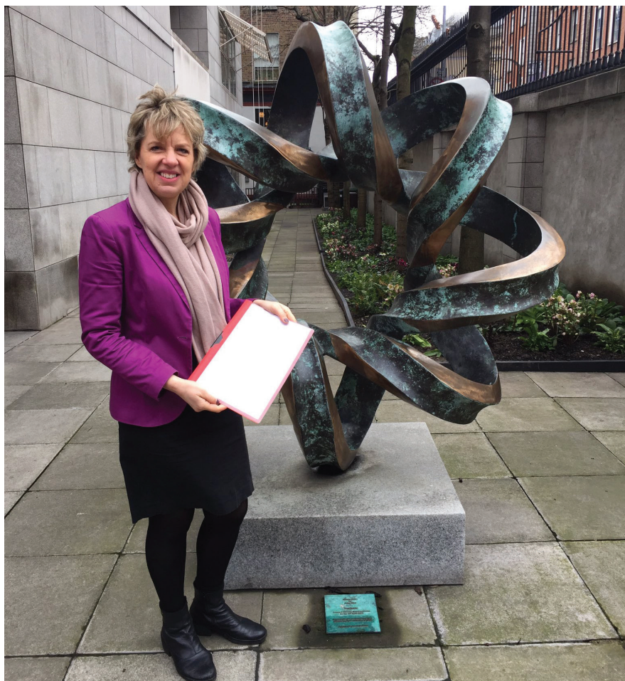
Handing in my nomination papers for the 2020 Seanad Elections in Trinity College.