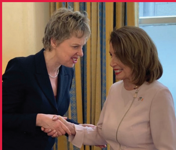
With Speaker Nancy Pelosi at her visit to the Houses of the Oireachtas as part of Dáil100, April 2019