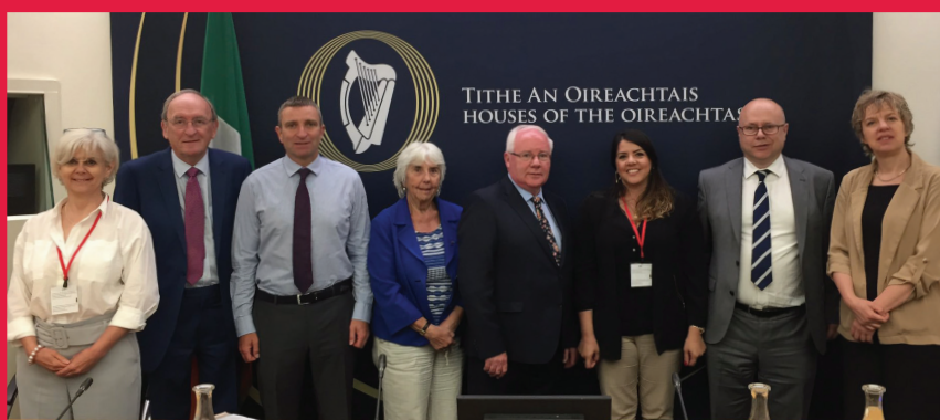
Pictured with other members of the Committee of Foreign Affairs, and International trade unionists, at a meeting on the Colombian Peace Process, 11 July 2019

I am delighted to invite graduates to join me online and I would encourage people to get involved! I update my website and social media regularly so that you can keep up with the work that I am doing. For more on my work as a Senator, see www.ivanabacik.com